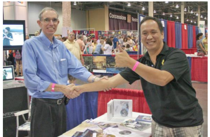
On the right is the Baptist Deaf Pastor from the Philippines