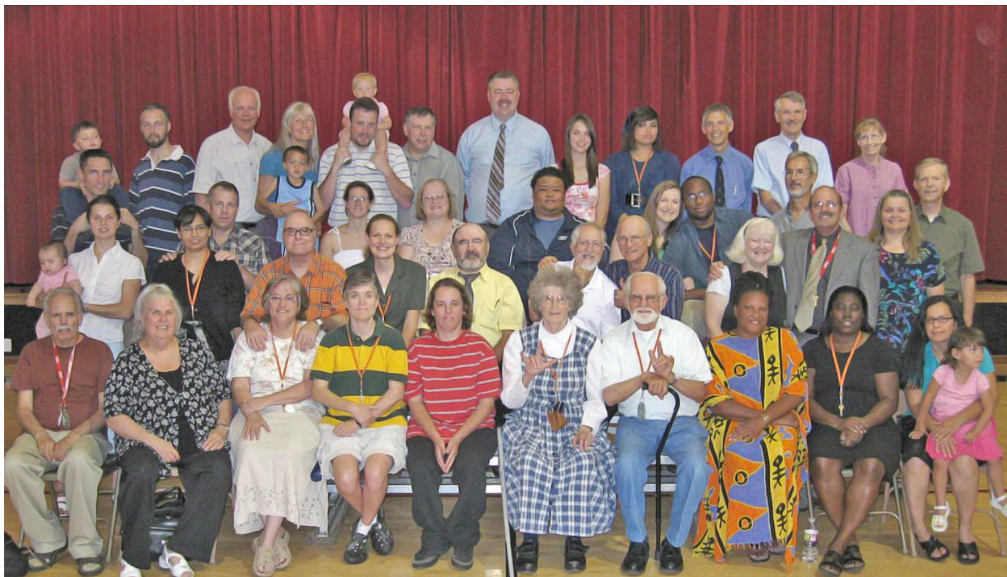
Western Deaf Camp Meeting