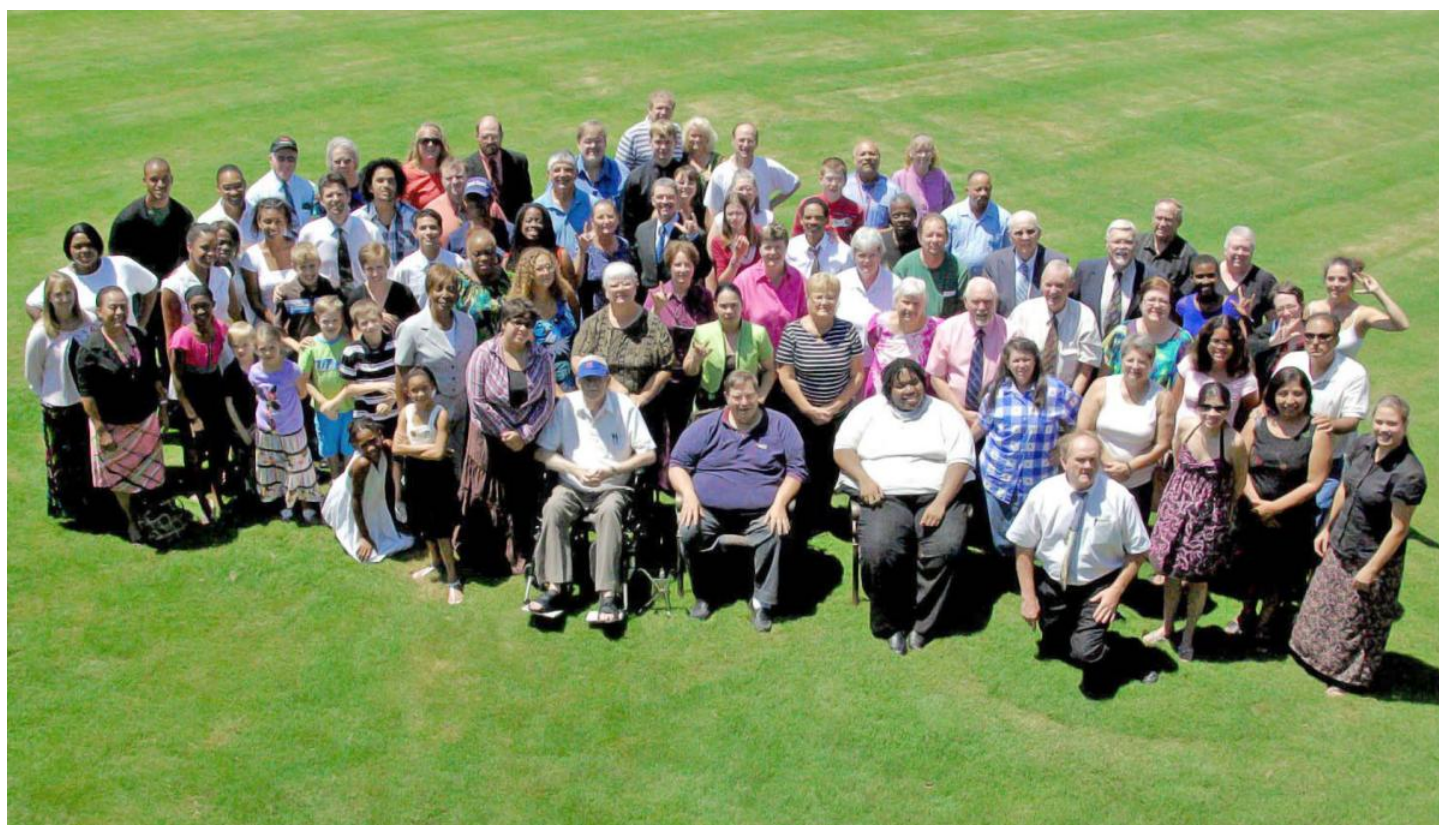
Southern Deaf Fellowship Camp Meeting