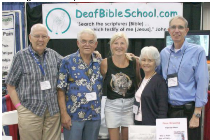
The lady in the middle is an Adventist from Germany.

Sharing the Three Angels’ Messages with the Deaf.