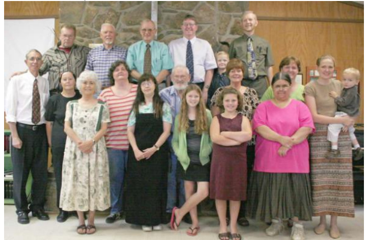
Mid-West Deaf Camp Meeting