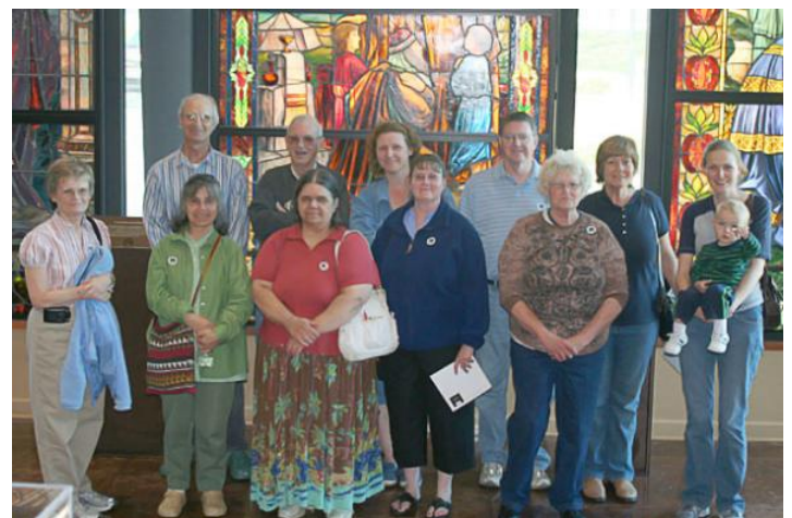
Oklahoma Deaf Reach attendees from six states come together to learn how to share Jesus with others.