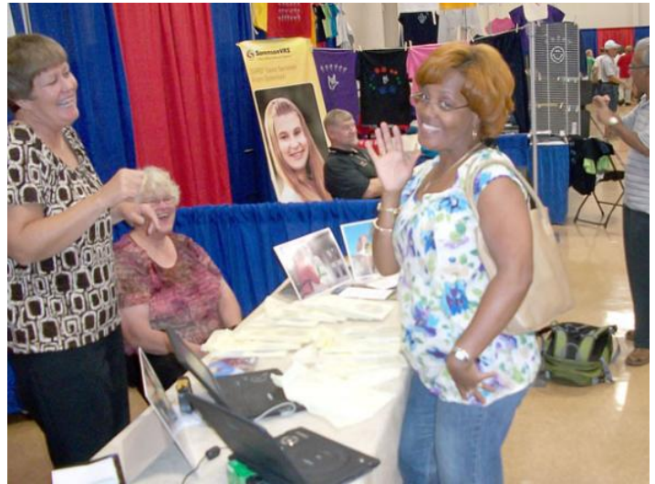
Sharing Jesus in Memphis, TN