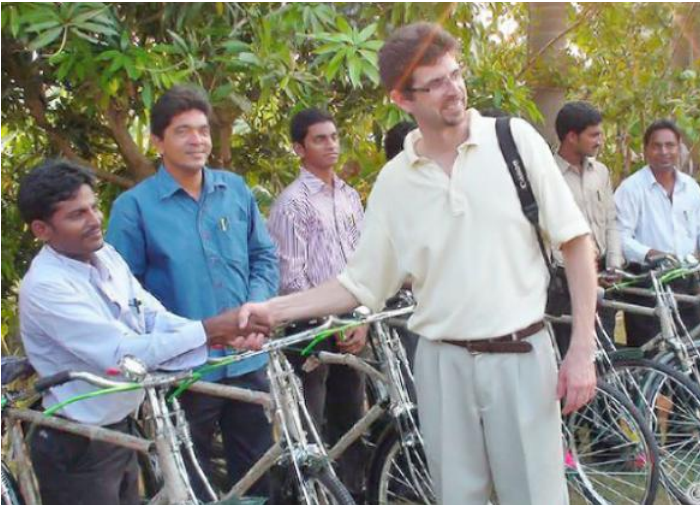
40 bicycles were purchased and given to the gospel workers so they can more easily travel to share the Word of God.

Friends, I encourage you try talk about Jesus and what He did in your life with your friends and family. Praise God for your blessings with them. People will see the love of God as you praise Him or talk good things about Him. Your words will plant "seeds" in people's minds and through the Holy Spirit they will seek God. That is how I accepted Jesus in my life, as my husband's friend who planted "seeds" in my mind.