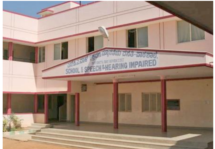
The Asian Aid SDA School for Speech and Hearing Impaired (Deaf) in Kollegal, India. This is the only known SDA school for the Deaf in the world.