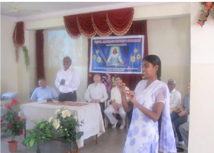
One of the gospel workers participate in a program during the training workshop.