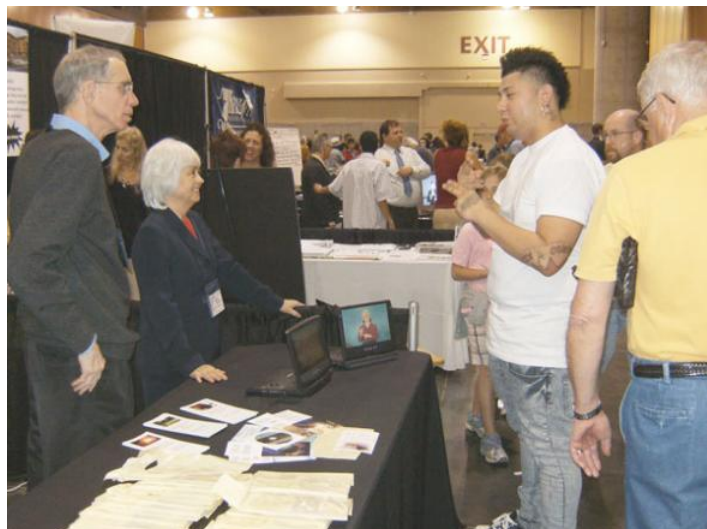
Young man visits our booth at the MATA Expo in Phoenix.

Sharing the Three Angels' Messages with the Deaf.