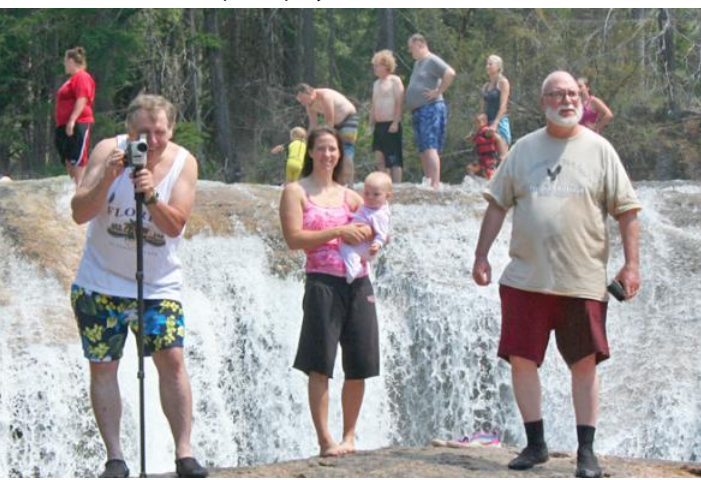
To spend a little time enjoying God's book of Nature, many went to the South Umpqua Falls for a little swimming and exploring.