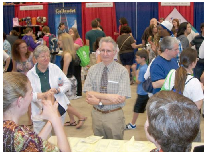
Our booth in Austin, TX