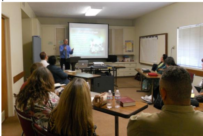
Deaf Reach lay-training program at Chula Vista, CA

Deaf Reach was held in Arkansas in 2004 and 2005, with Deaf members all across the United States attending. 3ADM decided to take the same training to regional areas so that more can attend. We created materials and an intensive weekend program. Since 2009, 10 regional programs have been held across North America. If you wish to have the Deaf Reach workshop in your area, please contact 3ADM.