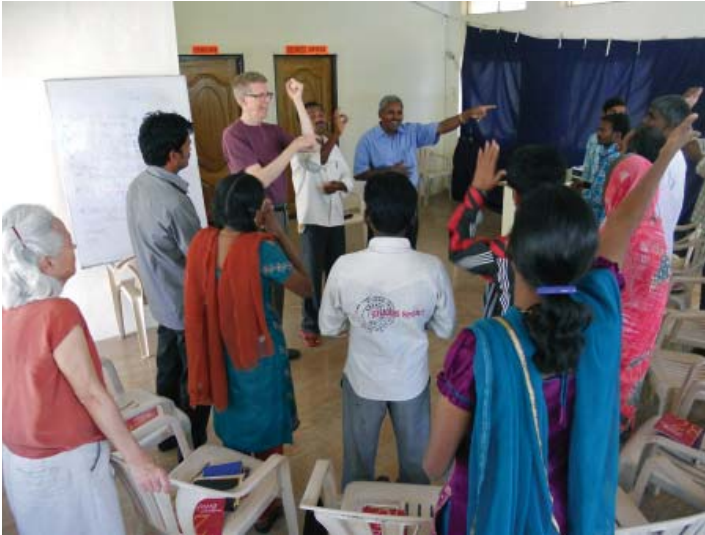
Interaction during one of the training workshops for the Gospel Outreach Deaf Workers.