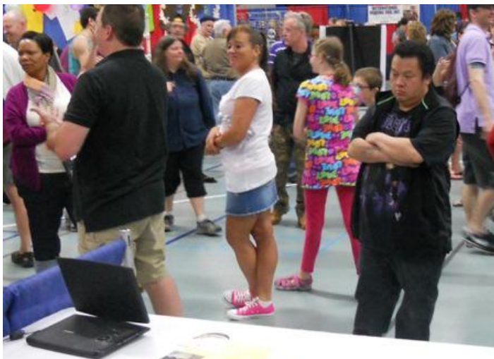
In St. Paul, Minnesota, a Deaf man pauses for some time to watch the new Signs of God's Love #6 DVD.