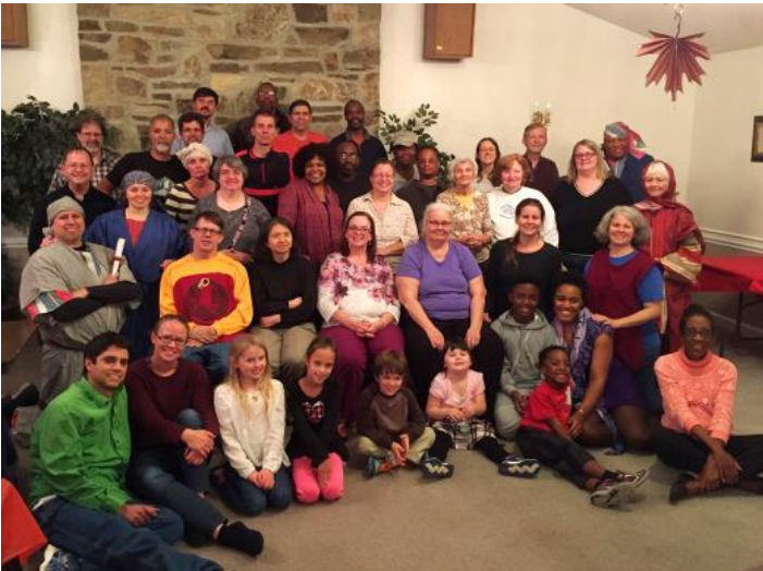
DEAF in Silver Spring, MD held their Annual Thanksgiving Dinner on November 13. Over 40 members and friends attended.