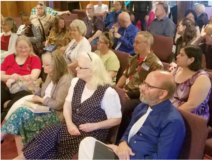
Deaf worshippers meet at the Tabernacle SDA Church in Portland, Oregon.

The Deaf group in the Portland, Oregon area have met at the Tabernacle Church 2009. In fact, this is the largest group of Deaf Adventists that meet in all of North America. It is a very active group with its own worship services in the youth chapel and also put on several events including an annual Deaf camp meeting.