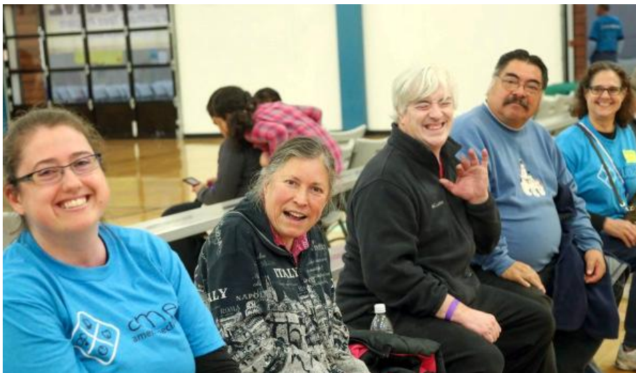
A few of the interpreters and Deaf who came to AMEN in Tacoma.