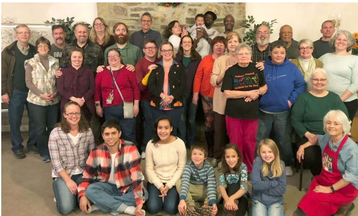
Group photo at the DEAF Thanksgiving Dinner in Silver Spring, MD

The Southern Deaf Fellowship also hosted their Thanksgiving Dinner on November 12. 50 people from the Deaf community came for food and fellowship.