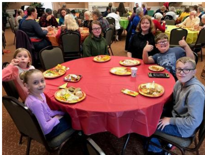
Fifty people enjoyed Thanksgiving Dinner at the SDF Church.