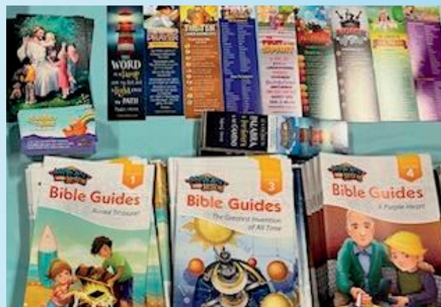
Sharing the love and teachings of Jesus through Bookmarks, Cards, and Bible Guides for Kids

We invite you to visit our booth at the upcoming Expos and experience our new booth design for yourself!