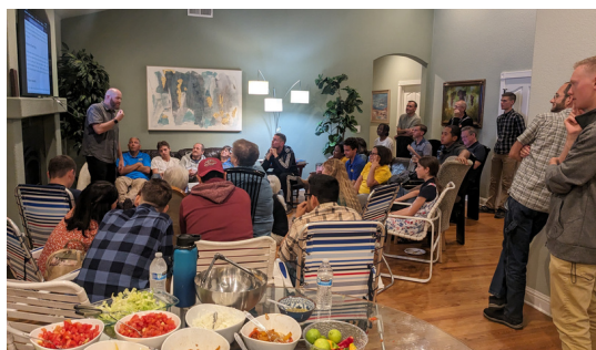
Sabbath Vespers at Deaf AFCOE Students' House