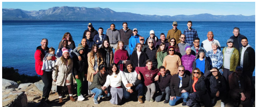
AFCOE Retreat at Lake Tahoe