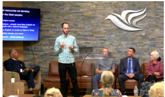
Deaf Ministry Presentation at Granite Bay Hilltop SDA Church

Granite Bay Hilltop Seventh-day Adventist Church , also known as the Amazing Facts Church, had a special event on October 21, 2023. They hosted a Deaf ministry presentation featuring six deaf students from Amazing Facts Center of Evangelism (AFCOE). It was an incredible event, and you can watch their inspiring presentation by clicking on this link: https://bit.ly/3umQgaP .