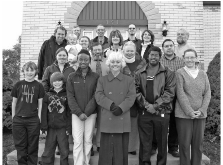
Group photo of the Deaf Reach Workshop in Rochester, NY

Deaf Reach will also be held in Oklahoma next April 9-11. For more information contact us.