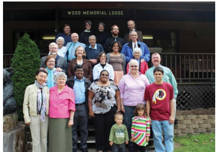
Group photo from the DEAR Camp Meeting which is held in October every year at Camp Blue Ridge in the beautiful mountains of Virginia.

We now are taking a winter break from the booth ministry. DeafNation Expo will host 12 expos in 2013. We are looking forward to sharing new materials with the Deaf next year.