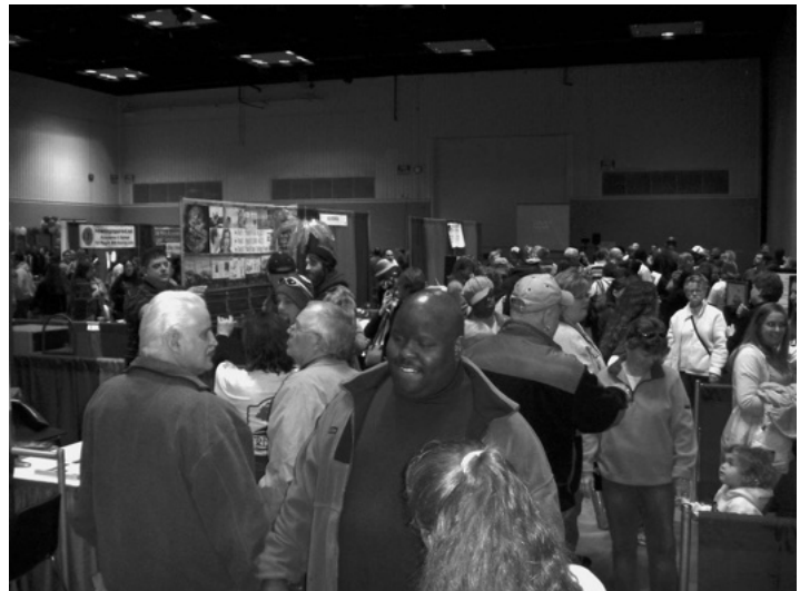
Indianapolis, Indiana ASL Expo

were free. They walked away happy with their packets.