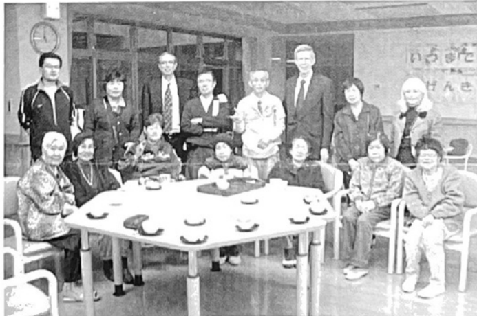
A side trip was taken to visit a nursing center for the Deaf. Visiting these precious people was a very special experience for the American visitors.