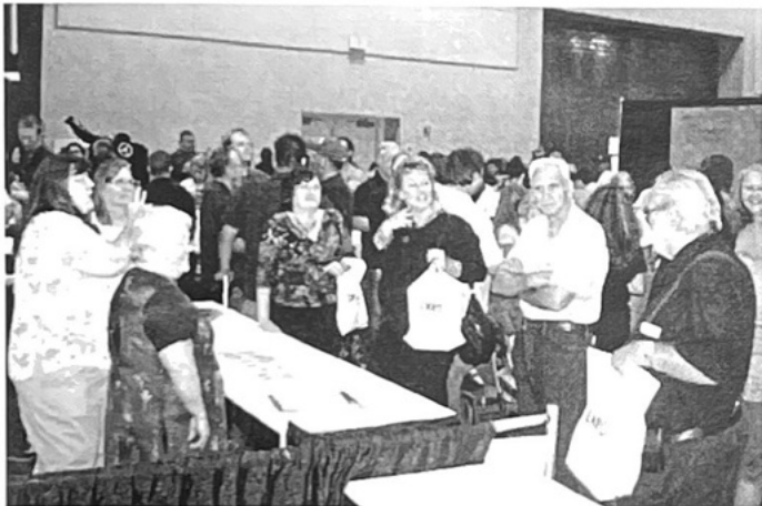
People enjoy chatting with our booth volunteers and are often amazed that we were giving away free DVDs, NT Bibles, and other materials.