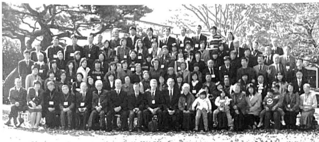
A beautiful group of souls! More than 120 people came to the Japanese Deaf Camp Meeting. Most of them are hearing people who work in Deaf ministry. There were about 41 Deaf attendees, some were non-Adventists.