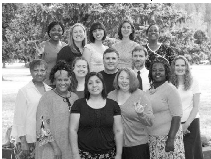
Adventist Interpreter's Workshop Group Photo