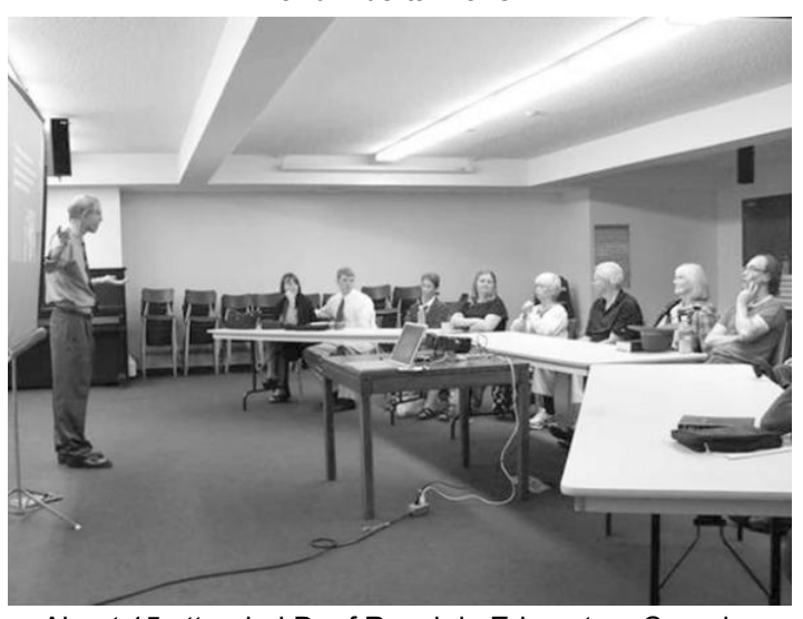
About 15 attended Deaf Reach in Edmonton, Canada.