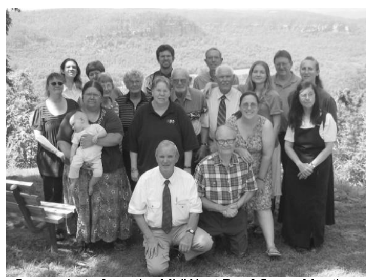
Group photo from the MidWest Deaf Camp Meeting, July 17-21.

Facebook is a website that many people all around the world use as a tool to stay connected to family, friends, and more. This is a great way to send out urgent news to many people within seconds. So, if you happen to already be on Facebook, look us up!