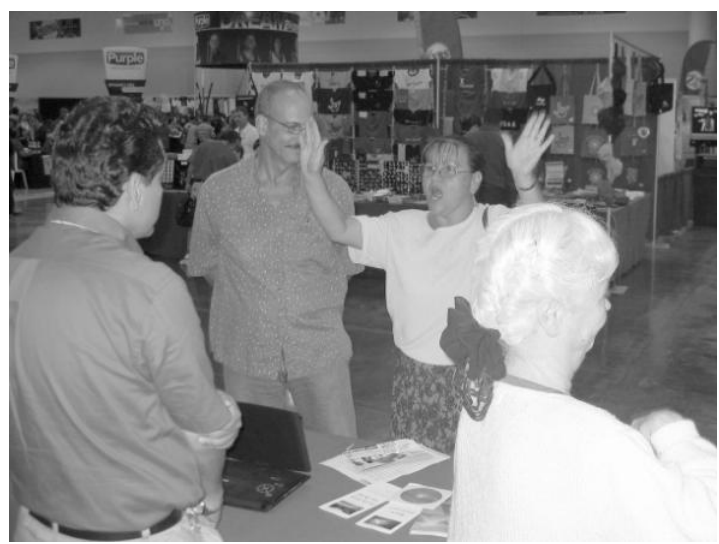
We were very busy at the DeafNation Expo in Puerto Rico! We unexpectedly ran out of packets by 11:15am, two hours after the expo opened! Most Deaf people in Puerto Rico use ASL.