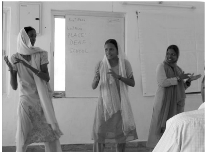
Song given by Deaf workers