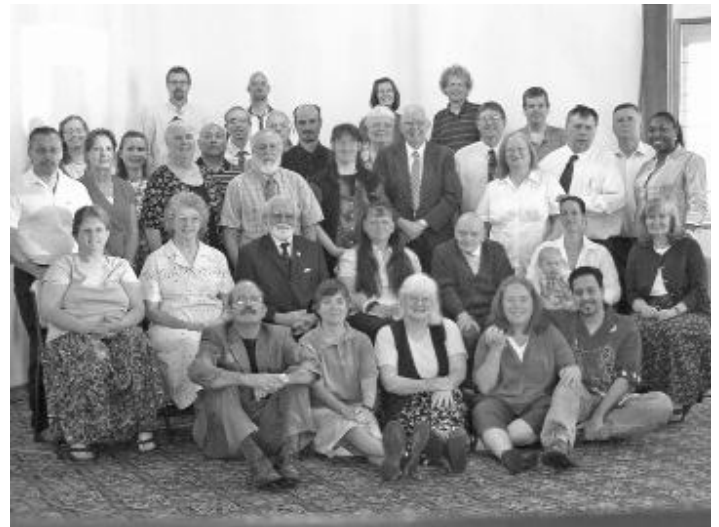
Large group attending Deaf Reach in Beaverton, Oregon