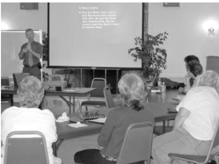
Deaf Reach was held at the Silver Spring church annex building on August 1 and 2. About 15 members attended.