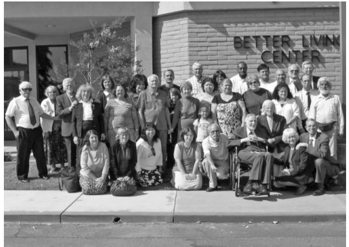
Deaf Reach in Lodi, California Group Photo

Contact ADM for information on how to have Deaf Reach in your area!