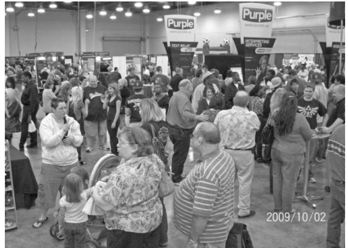
Oklahoma City, OK DeafNation Expo