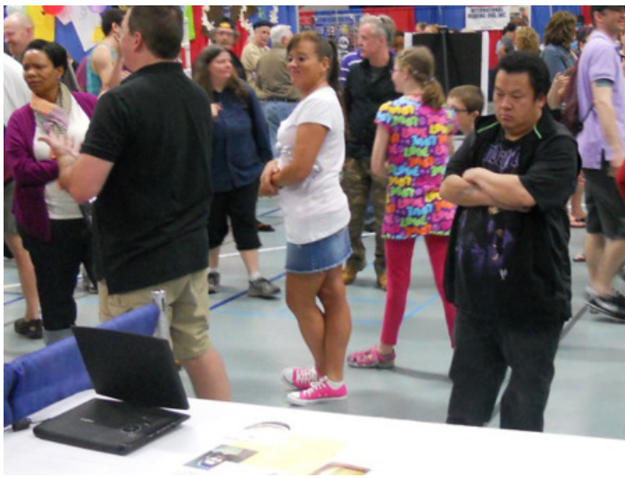
In St. Paul, Minnesota, a Deaf man pauses for some time to watch the new Signs of God's Love #6 DVD.