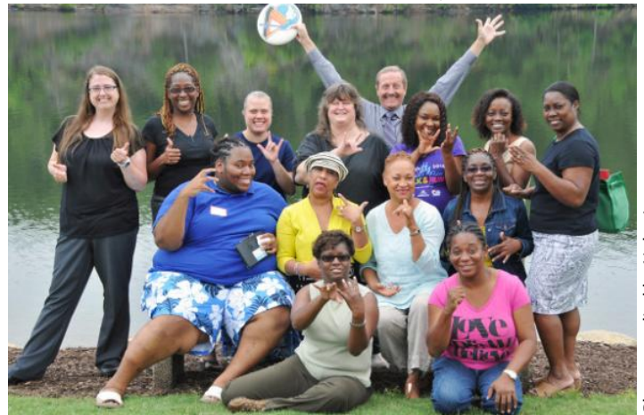
Interpreters posed for a fun group photo.