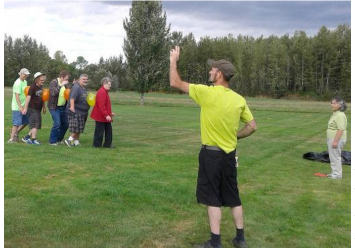
Outreach Picnic and fun games in the Portland, Oregon area.

The Deaf group at the Tabernacle SDA Church in Portland, Oregon held their annual picnic on September 20th at a park on Lake Vancouver. This fun picnic was a way for Deaf non-SDAs to become better acquainted with Adventists and to encourage former Adventists. This picnic was a success! Eighty people came, and about 30 of them were non-Adventists! The lunch featured garden burgers and pumpkin burgers (vegan and gluten free) and fruit salads. After the yummy lunch, many played volleyball and the fun caterpillar game. As a result, two became interested and remain friendly with us while others left with a good, positive impression.