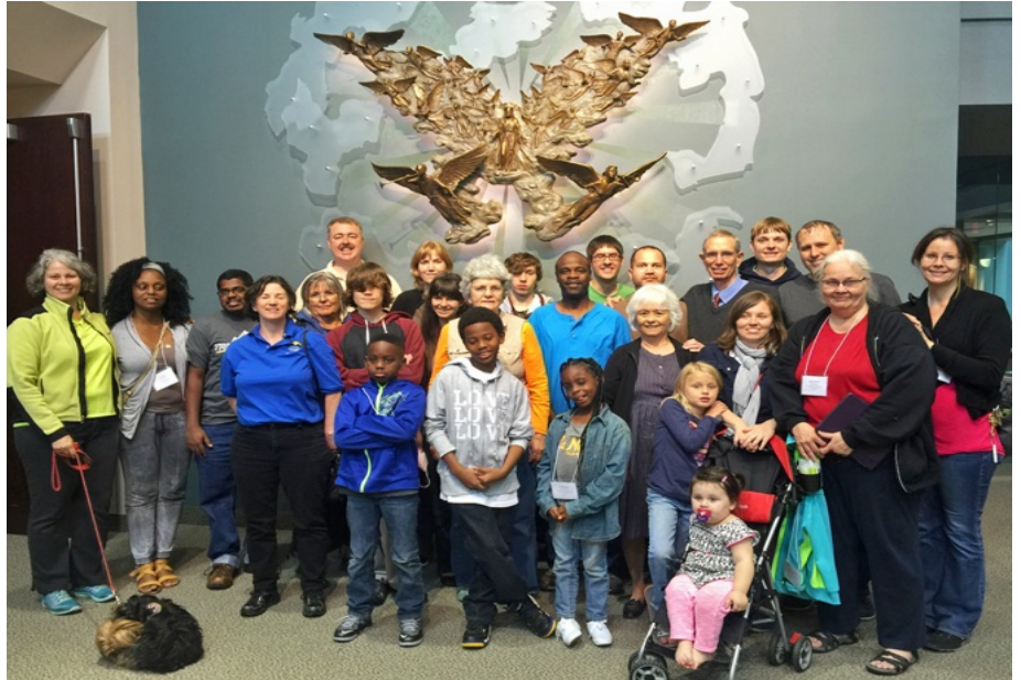
DYAC in front of an bronze statue of Jesus's second coming at the General Conference Office.