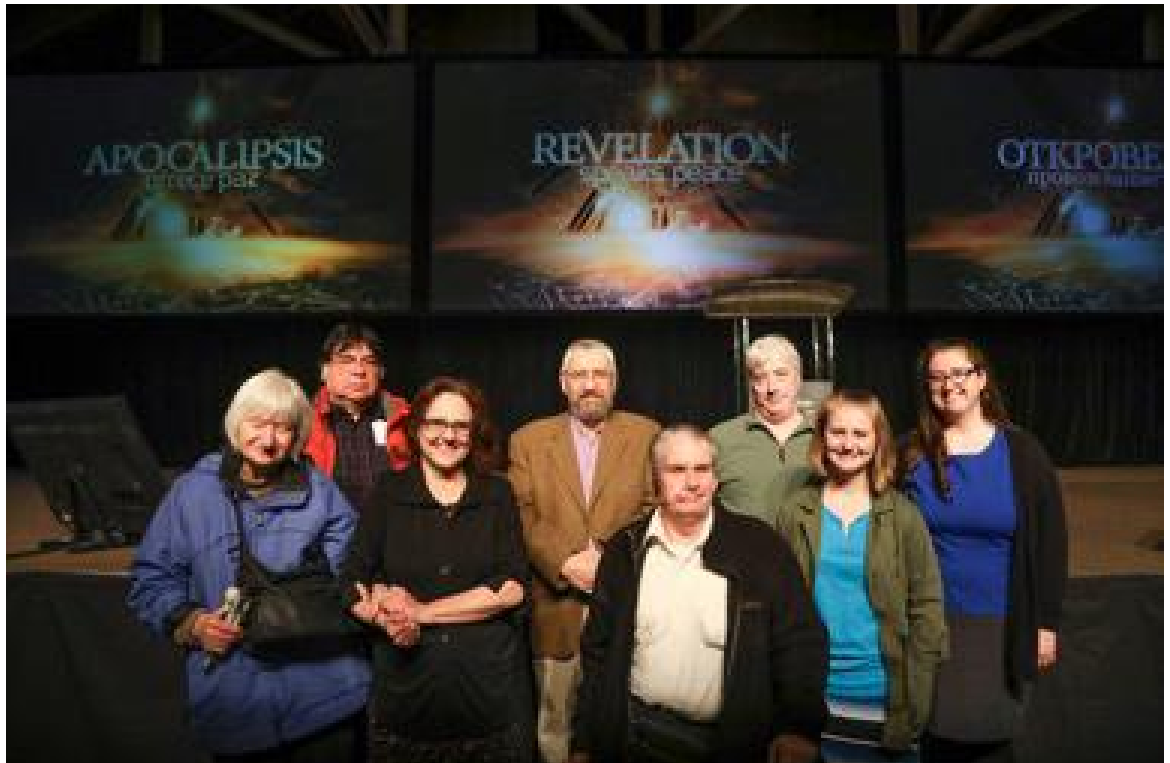
Washington Conference Deaf pose for a picture at Revelation Speaks Peace.