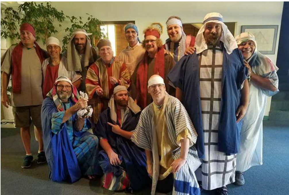
The "Twelve Disciples" getting ready for Communion service on Friday night.

While the week went by quickly and many shed tears on Sunday as they headed home, the message of the week still continues daily: what are you willing to sacrifice in your life to be ready for the soon return of Jesus and His outpouring spirit?