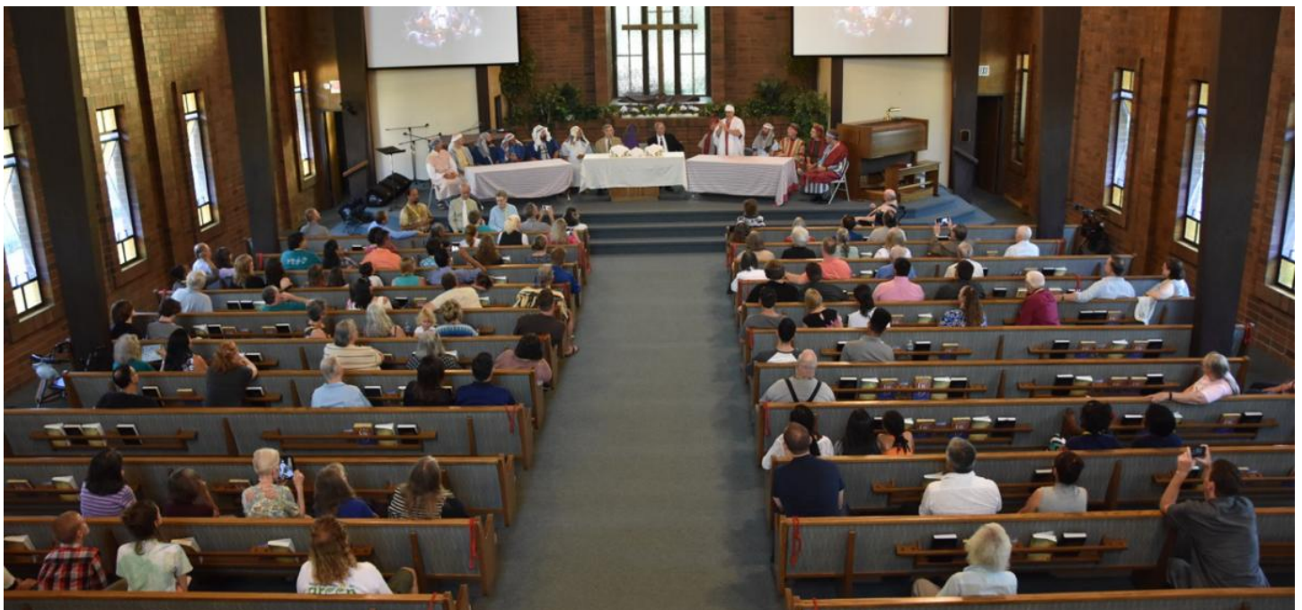
All gather in the Academy Church for Communion service on Friday night.